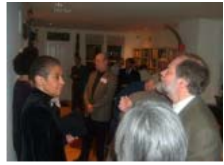
GWADA Members enjoy the company of Delegate Eleanor Holmes Norton