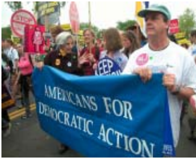
ADA and GWADA Members March for Women's Lives in Washington, DC